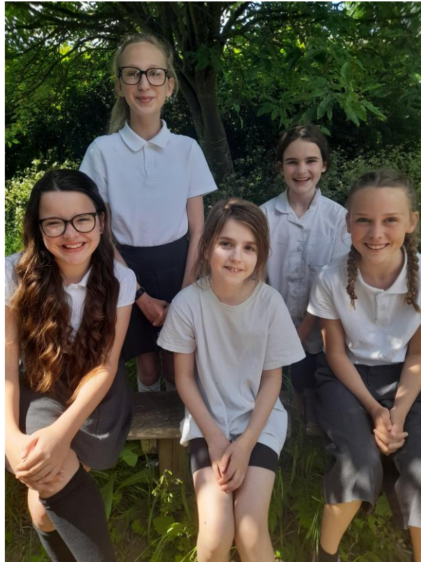
1 - Our nature experts!